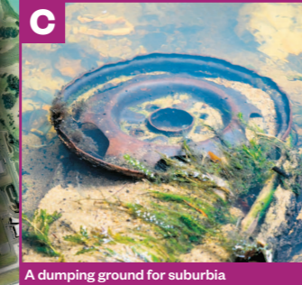
A dumping ground for suburbia