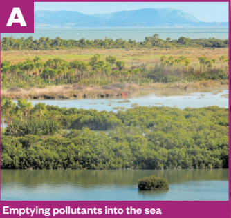
Emptying pollutants into the sea